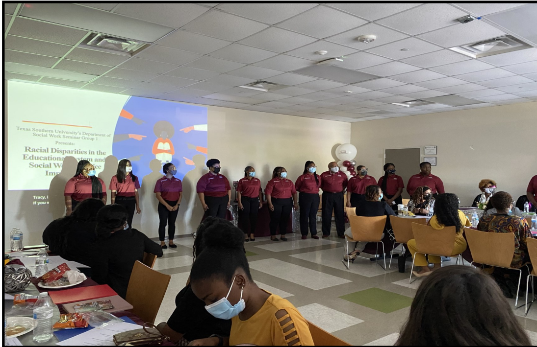
Senior Seminar Presentation...