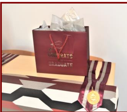
Graduation Stole and gifts