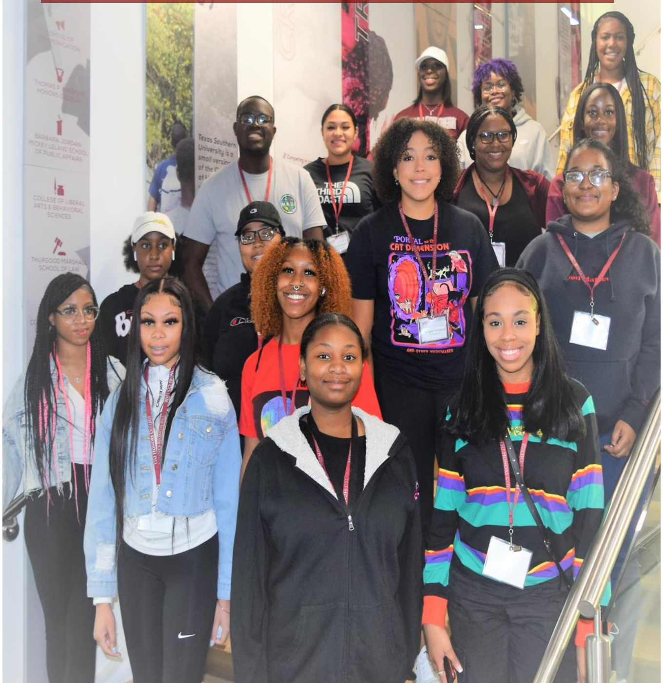
High-achieving High School Seniors Invited to Honors for a Preview of Academics and Student Life in the Honors College