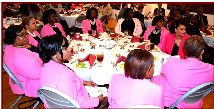
Members of the Tau Omega Chapter of the Alpha Kappa Alpha Inc. Sorority

The luncheon raised $7,000.00 benefitting the programs sponsored by the college.