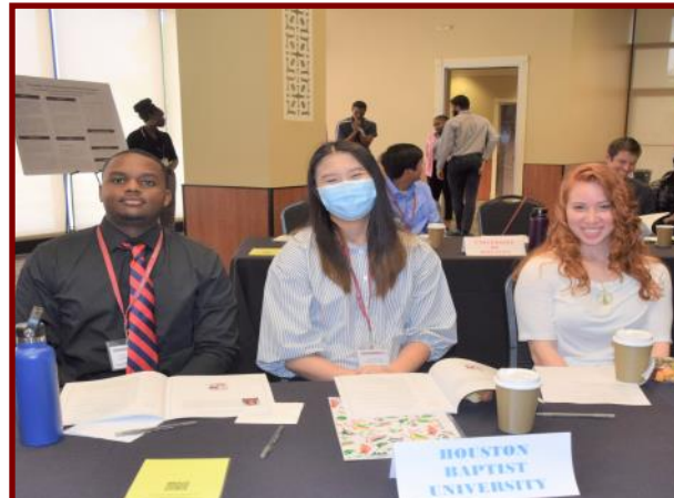
Participants from Houston Baptist University