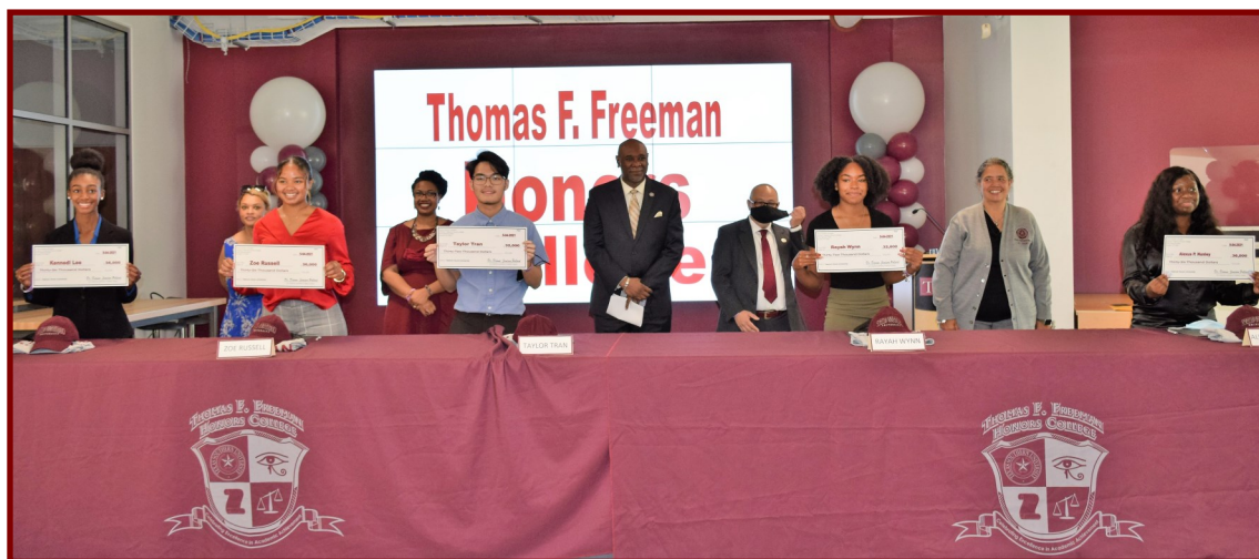
Academic Signing Day: New recruits with TSU Administration