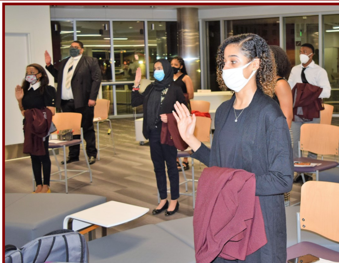
Freshman inductees stating the Induction Pledge