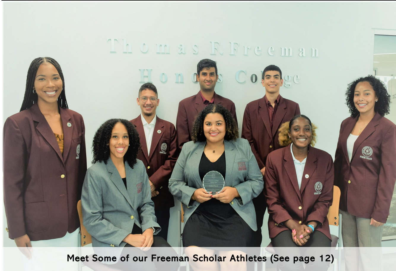
Meet Some of our Freeman Scholar Athletes (See page 12)