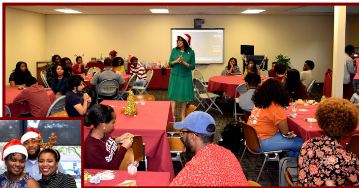
Playing themed games