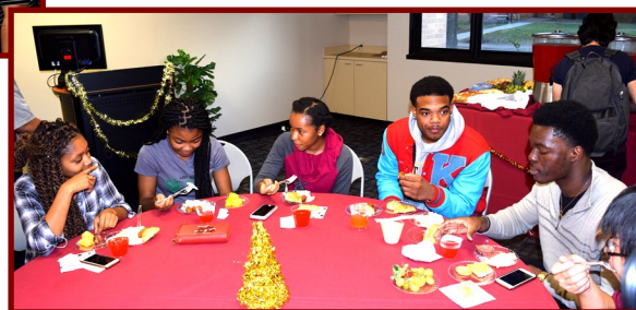
Good food and good times!

and laughing. There were gifts for all in attendance. The festive menu included sandwiches, pasta and meatballs, along with eggnog and wassail. For dessert, as renowned chef Julia Child once said “a party without cake is just a meeting,” there was cake!