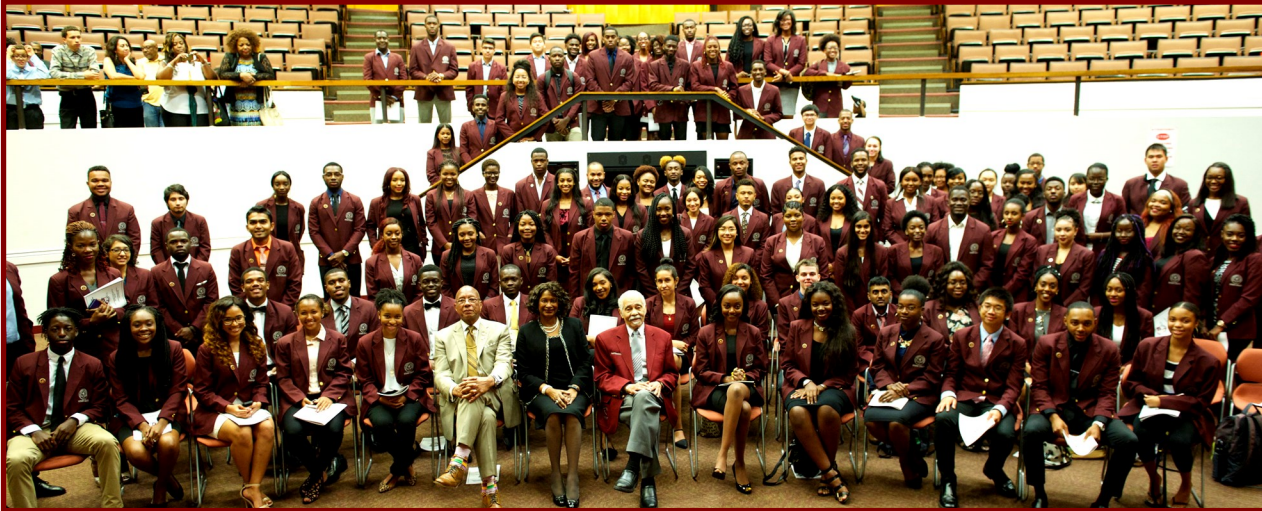
Honors Induction and Awards Ceremony, Fall 2017