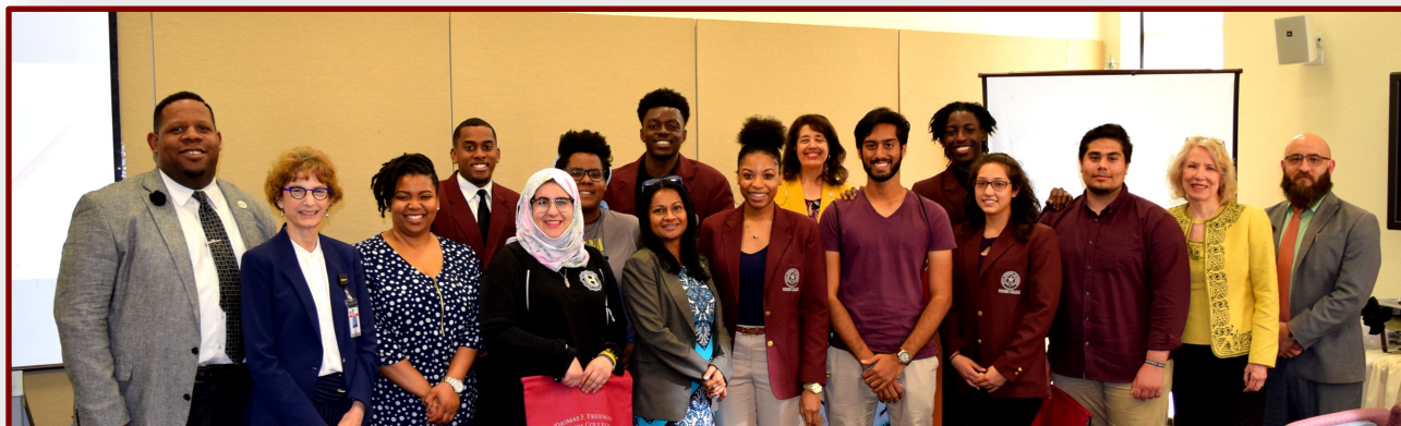
Honors staff and Honors Scholars along with junior college honors program directors and their invited students

The Honors College hosted an Open House for Junior College Honors Program Directors and students on March 29th, 2018.