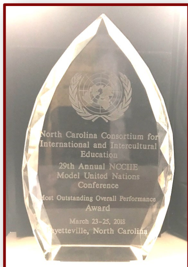
The Most Outstanding Overall Performance Award