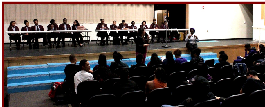
Honors Scholars serving as panelists at Lyndon B. Johnson High School

They enjoyed lunch at the Capital Grille and later toured the Bob Bullock Texas State Museum, where every floor was filled with exhibits, artifacts and movies. The scholars saw “Star Destiny,” a movie about the history of the state of Texas. On the third day, the scholars visited the Lyndon B Johnson high school where they were met with a group of high-achieving students. The Honors Scholars served as panelists as each