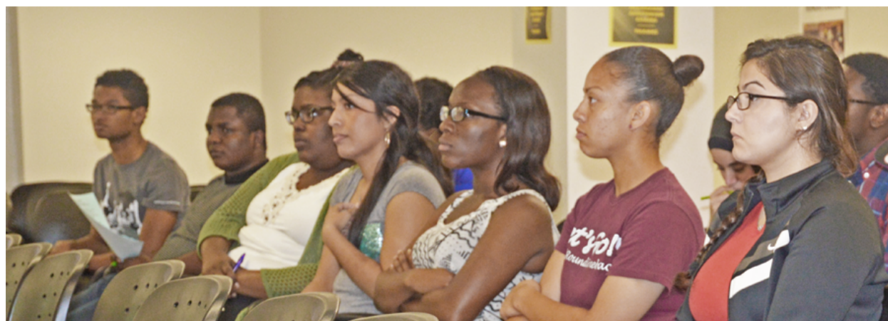
The audience at Research Week included many of the fellow scholars in the Honors College.