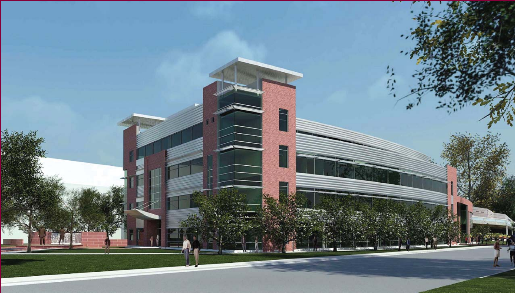
LEONARD H.O. SPEARMAN SCIENCE & TECHNOLOGY BUILDING