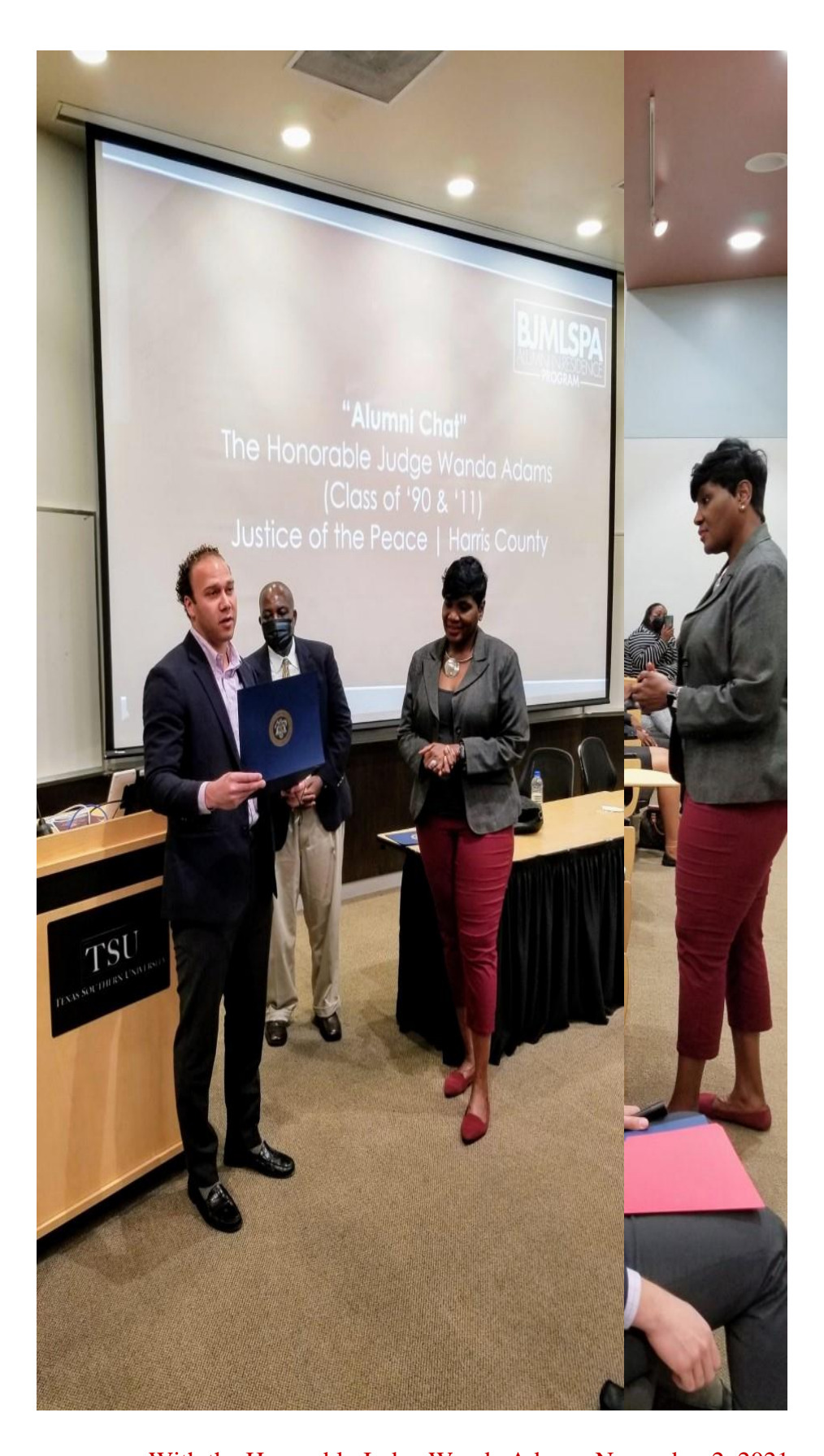
With the Honorable Judge Wanda Adams, November 2, 2021.