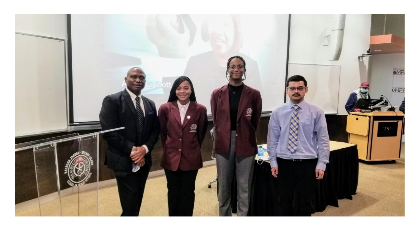
Celebrating the life and legacy of late Congressman Mickey Leland, December 4, 2021.