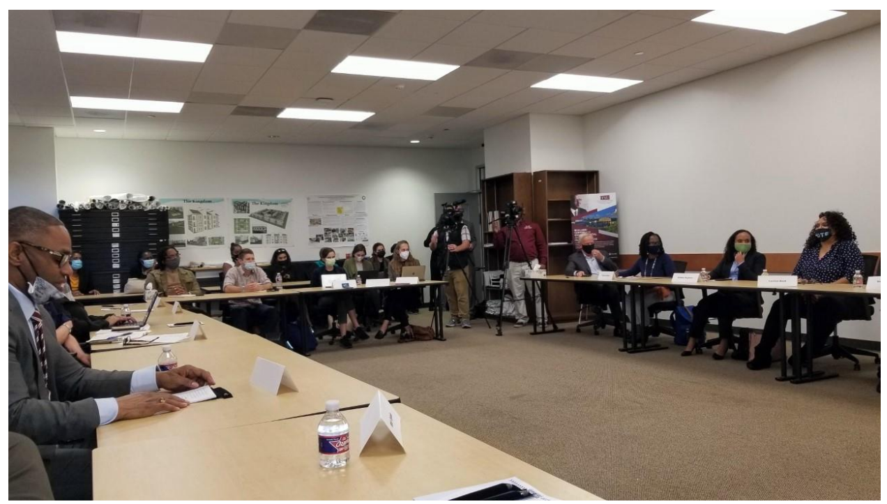
UPEP students with the EPA Administrator, November 18, 2021.