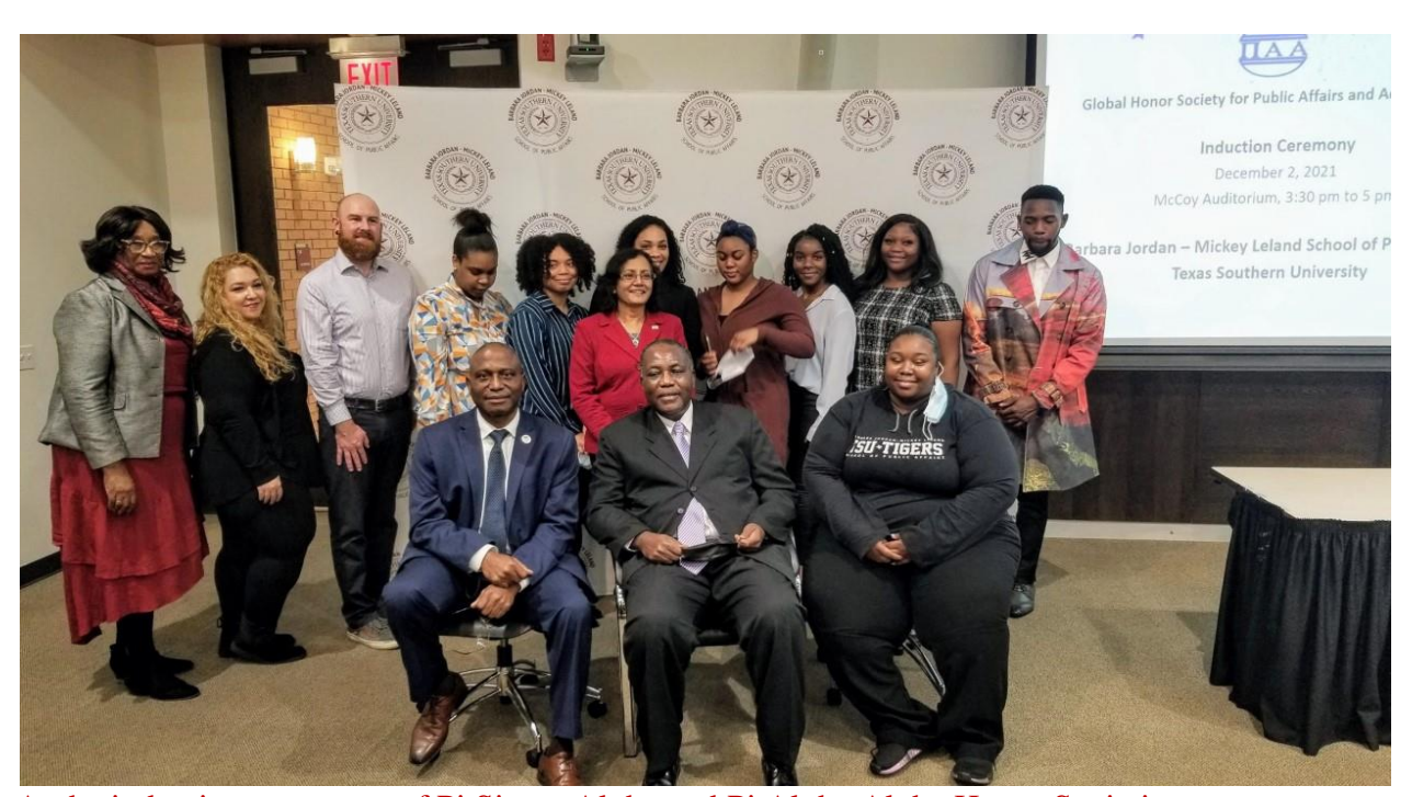
At the induction ceremony of Pi Sigma Alpha and Pi Alpha Alpha Honor Societies, December 2, 2021.