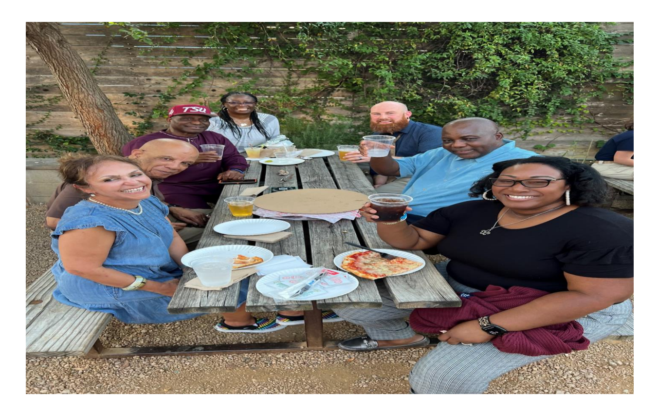
Inaugural Faculty Happy Hour @ Axelrad Garden, Houston, Sept 22, 2022