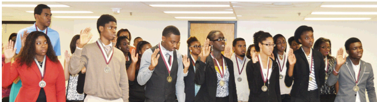
The scholars the Honors College inducted included many first-time-in-college freshmen (above).