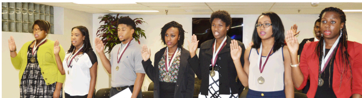
The inductees also included students (above) who were continuing in, or transferred into, TSU.

There were palpable lumps in the throats of many members of the incoming class of Thomas F. Freeman Honors College scholars when they underwent their induction into the College on December 3, 2013.